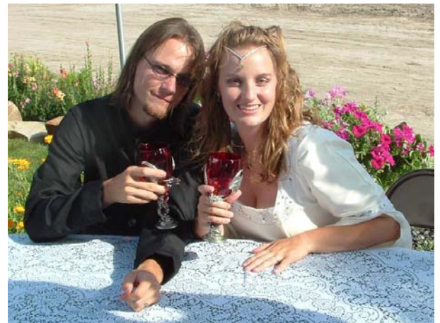
The happy couple After the ceremony